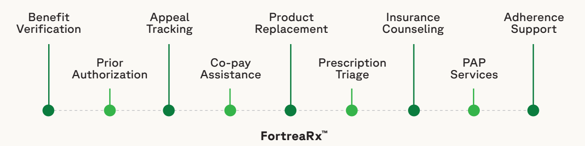
Figure 1: end-to-end case management, reimbursement, fulfillment and specialty pharmacy

The new comprehensive patient support program (see Figure 1) provides end-to-end case management, including benefit verification, prior authorization and appeal tracking support, access to co-pay assistance, prescription triage, product replacement, insurance counseling and patient assistance program (PAP) services. For un- or under-insured patients, we remove barriers, assessing their qualifications for patient assistance so they can receive the product through our specialty pharmacy. We also support the refill process to avoid any lapse in patient treatment. In addition to providing a personalized reimbursement and fulfillment experience to patients and healthcare providers, the Fortrea technology platform allows for efficient and trackable delivery of services for effective program oversight.